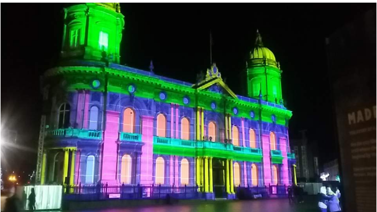
Hull City of Culture 2017

Some towns may be able to take advantage of discounted rates. Healthy High Streets partner Exterior Media offered discounted rate on bus advertising to Healthy High Street towns. If linked to specific town campaigns – e.g. to market Christmas activities, car parking and late-night opening initiatives, events, festivals, fairs, activities unique to your town, this helps boost visitor numbers and local pride.