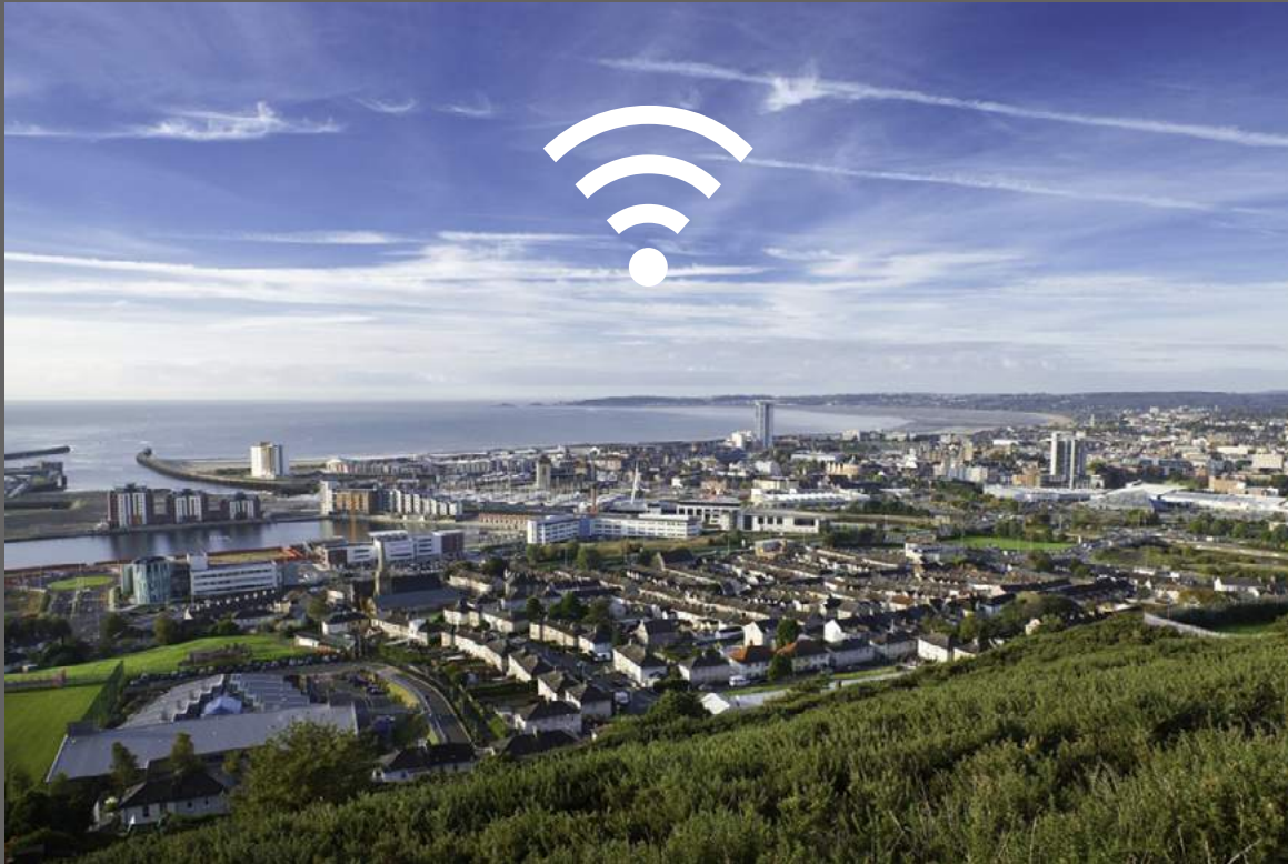
Swansea City Centre

Swansea is one of the first places in the country with BT Ultrafast broadband (speed up to 3.9Gbps) and it is transforming the town, making it more attractive for businesses to relocate.