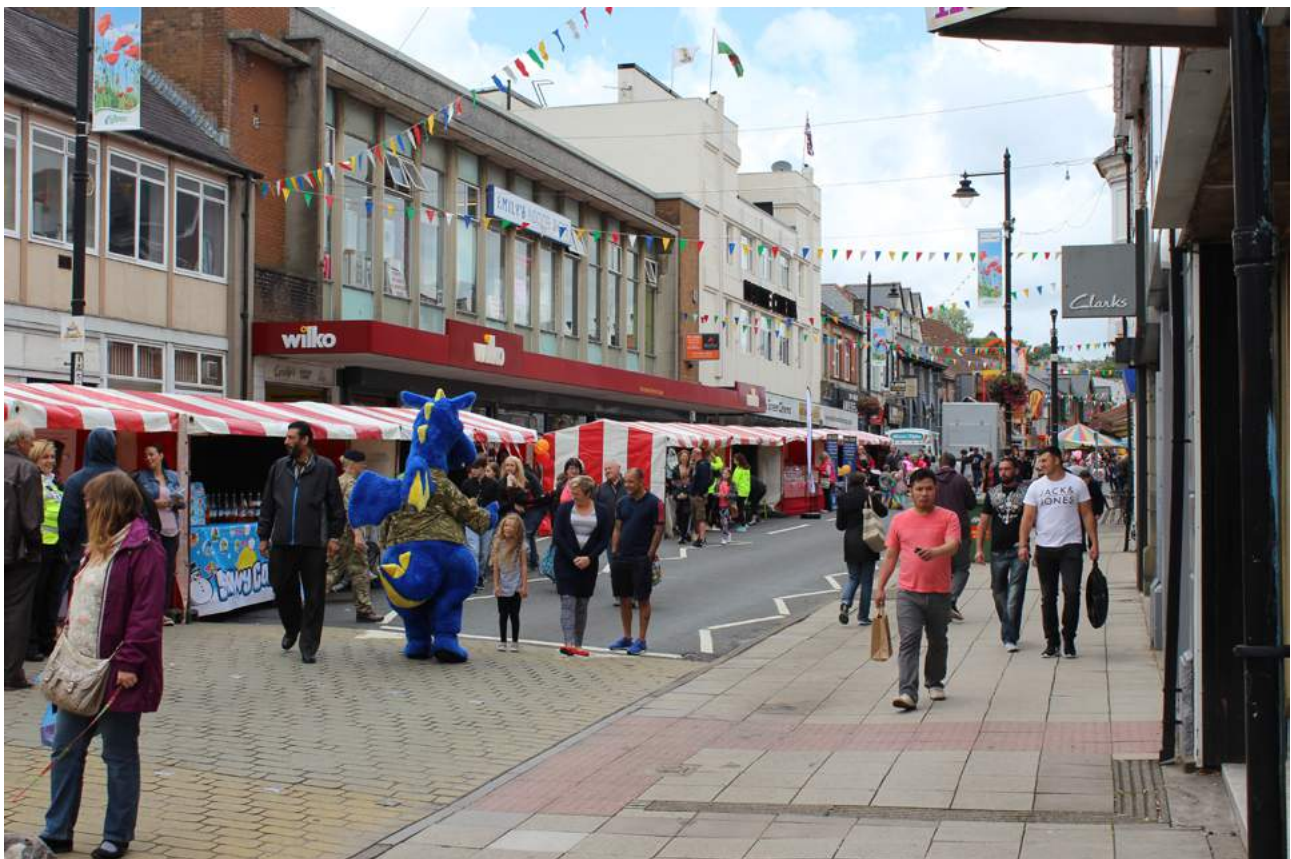
Blackwood High Street, Wales.

Healthy High Streets has been a great catalyst to help shape our community ambition. To have a real sustainable impact on communities you need to understand the fundamental purpose of your organisation and how this can be articulated through initiatives and activities that fulfil that purpose. It is in this strategic approach that businesses can really make a lasting difference. By using learnings from our participation in the Healthy High Streets programme we have been able to step back and look at how we were approaching our community activity and approach it in a more strategic way creating value for us and our team members who love getting involved.