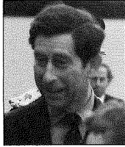
His Royal Highness The Prince of Wales