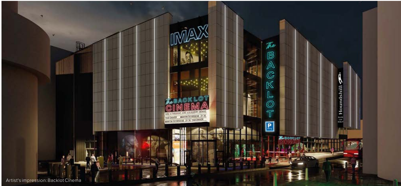
Artist's impression: Backlot Cinema