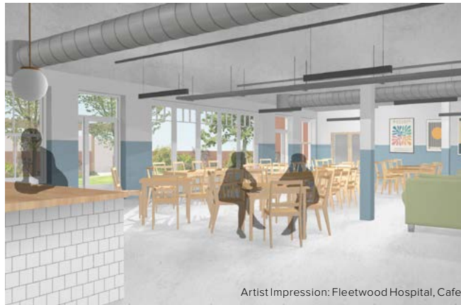
Artist Impression: Fleetwood Hospital, Cafe

To complete the ground floor vision, a café and community rooms will open soon, along with a new Youth Hub (under construction), which will be run by Fleetwood Town Community Trust. Macmillan Cancer have brought much needed support to the community for both cancer patients and their families. North West Ambulance Service are also moving into the Hub.