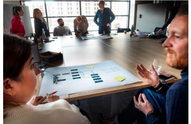
Photographs from Workshop 1 of the Circular Fit-out Lab in which participants mapped system barriers, identifying the roles of key internal and external stakeholders.